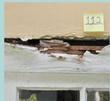
Severe termite damage is readily apparent at multiple windows. Water seepage effects walls and raises the interior relative humidity.

The author's residence is currently in danger of destruction from heat, humidity, pests, and the sheer passage of time. Worse, the irreplaceable collection is suffering from intense humidity and fluctuations in temperature. Some windows no longer open which is severely detrimental to the collection, the wood is not termite proof, and the quality of the roof is inferior.